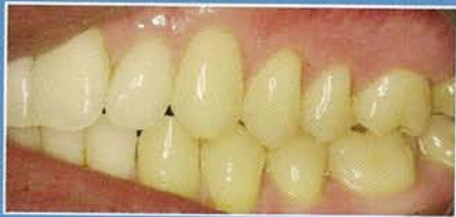
Before Opalescence Trèswhite Supreme