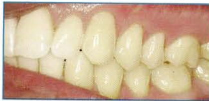
After use of Opalescence Trèswhite Supreme